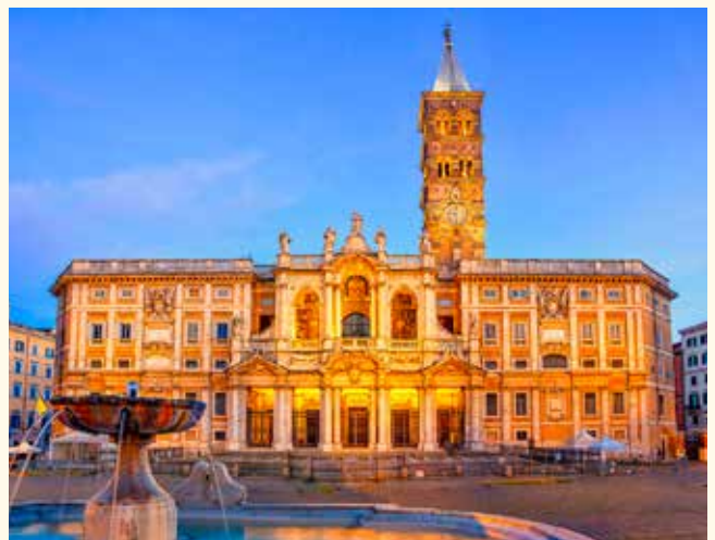
ST. MARY MAJOR BASILICA