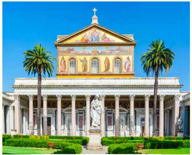
ST. PAUL OUTSIDE THE WALLS BASILICA