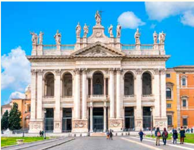
ST. JOHN IN LATERAN BASILICA