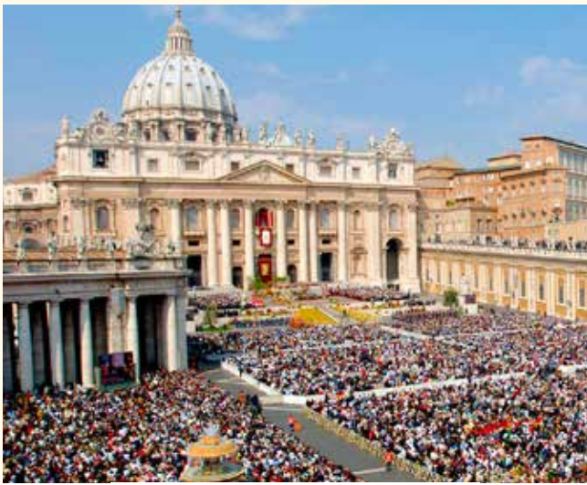
ST. PETER BASILICA

Door, then the other Holy Doors are opened. The Holy Door remain opened during the whole Jubilee Year.